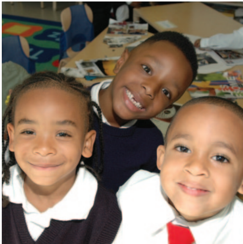
Faces of The New American Academy

"I realized Chabad was the community I wanted to belong to. What I liked about Chabad is that our mission is very simple—it is to create a heaven on earth. Whatever action we take has got to be toward that purpose. I told the kids, 'You have a purpose in life; you are unique; you are not alone; your mission here is to create a heaven on earth and to make this a better world.' I needed both the love of Chabad and the structure of the military to succeed."