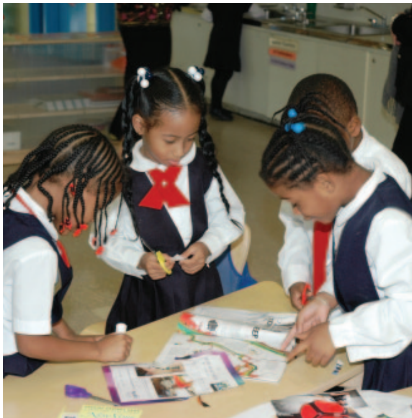
New American Academy students work on interdisciplinary language arts-math-art education project